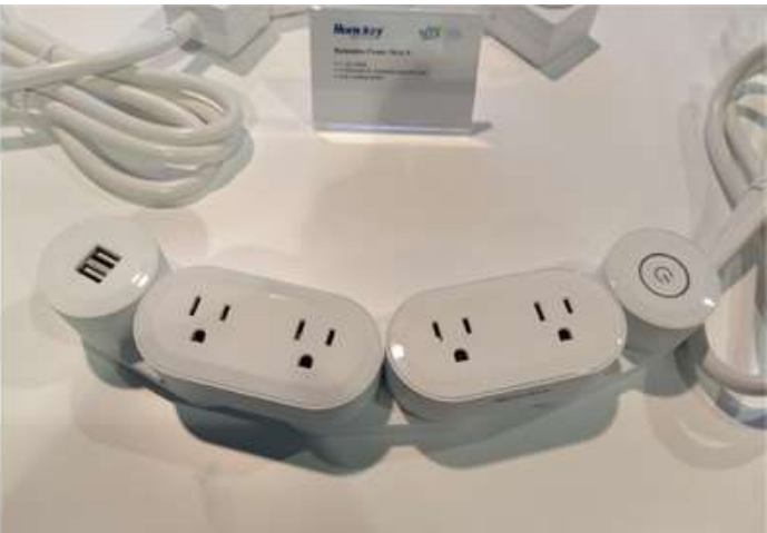
The 3-in-1 power strip is integrated with 3 methods to charge, AC socket charging, USB charging and wireless charging. It is equipped with 2 US sockets and 2 USB ports on the side panels, and features a 10W wireless charger on the top to charge Qi-certified devices such as iPhones and Samsung smart phones.