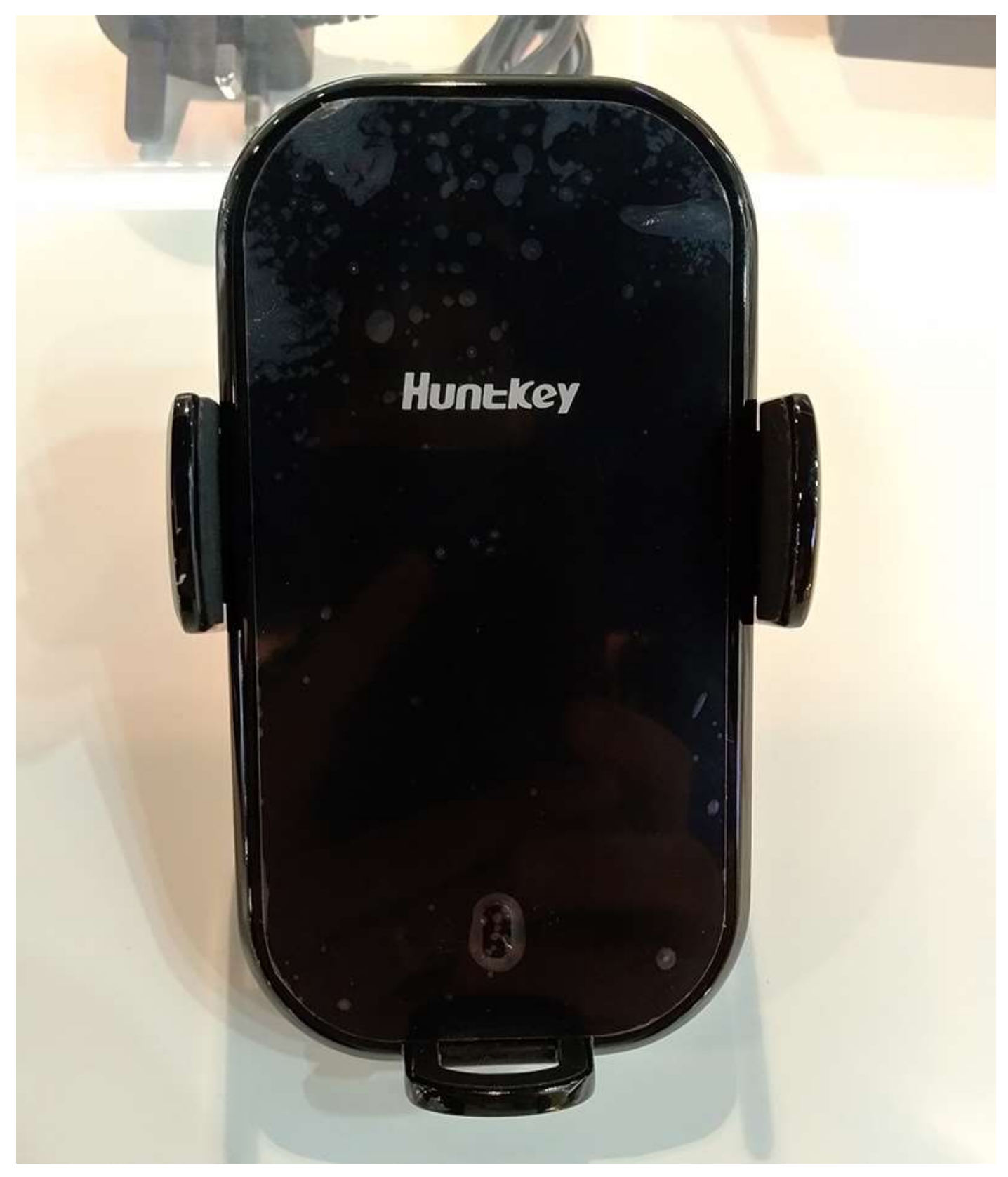
Apart from the above, Huntkey also display its LED lights, wireless chargers, USB charging stations, PC monitors, surge protectors and other product categories at the show.